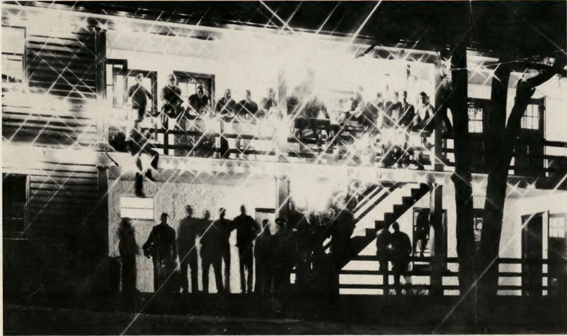
Star-streaked appearance is given by Christmas lights as Band Barracks bedecked with cadets, poses for snapshot.